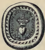
SEAL OF THE LETTER.